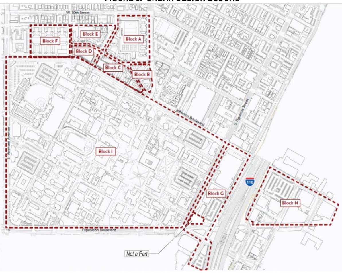
FIGURE 3. URBAN DESIGN BLOCKS