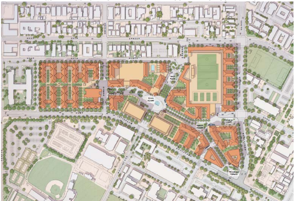
FIGURE 1: CONCEPTUAL DEVELOPMENT SCHEME FOR SUBAREA 3

Note: Actual development may include an Academic Tower on the Northeast Corner of Jefferson Boulevard and McClintock Avenue and a Residential Tower located mid-block along McClintock Avenue. Each Tower shall comply with floor area limitations established in Table 1 (Land Use Table), and with height, setback and stepback limitations established in Section 7 (Urban Design Regulations).