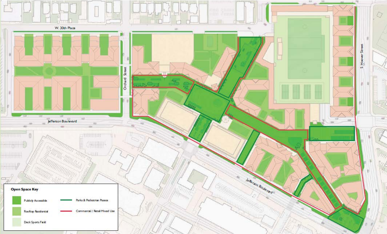
FIGURE 4. CONCEPTUAL OPEN SPACE DIAGRAM