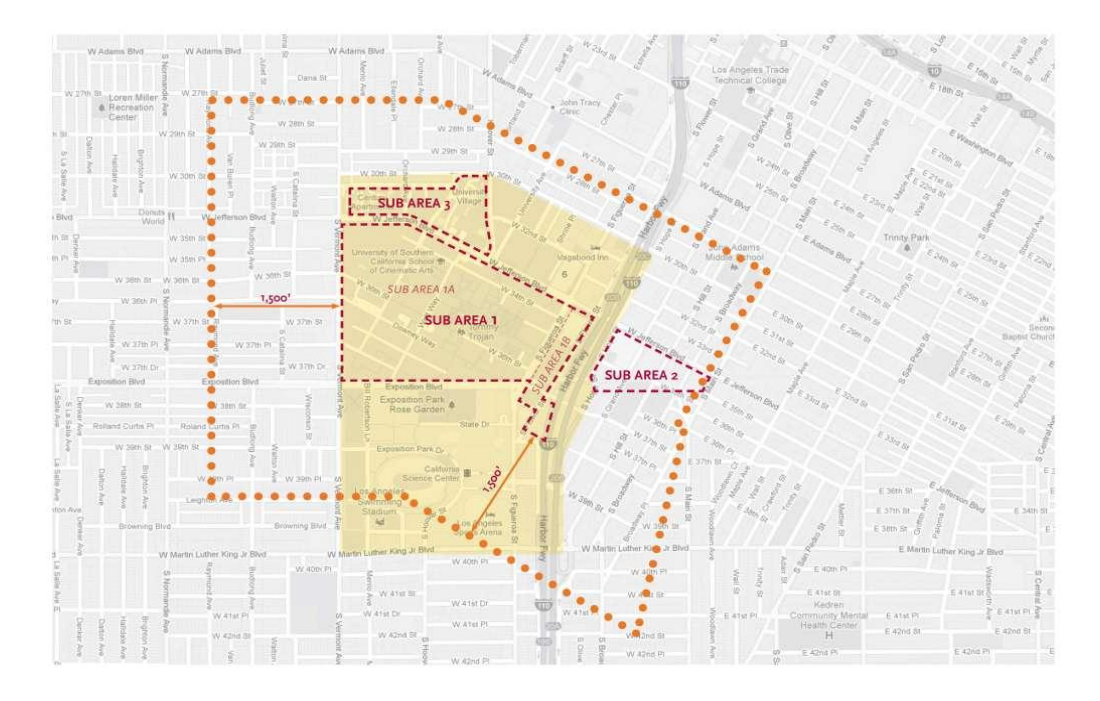
FIGURE 6. AREA FOR FUTURE PARKING LOCATIONS.

F. Parking Space Design. Notwithstanding any provision in the LAMC to the contrary, up to a one-foot by one-foot column intrusion may be permitted into one inside corner (opposite the drive aisle) of a standard parking stall, as shown below. All other provisions of the LAMC relating to the design of parking spaces shall be applicable to a Project within the Specific Plan area.