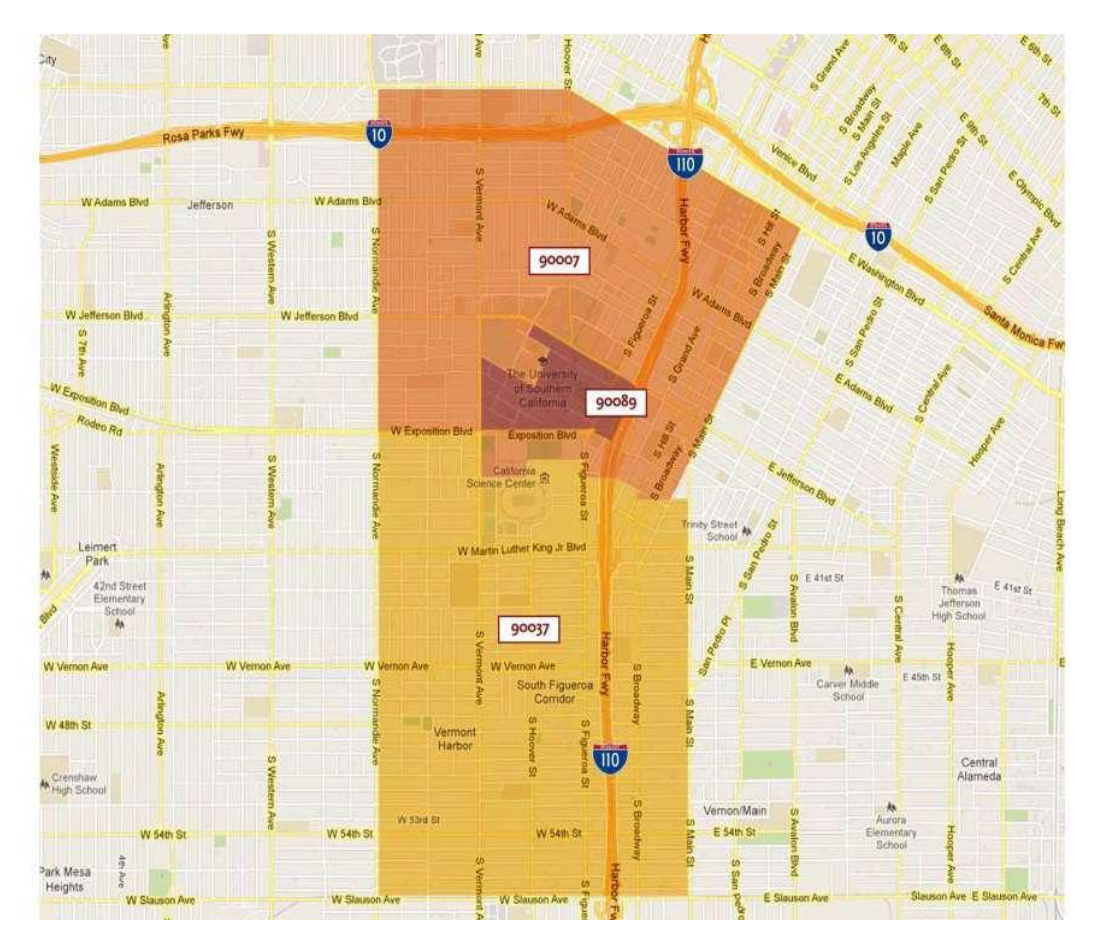
FIGURE 5. GEOGRAPHIC BOUNDARIES OF THE FTE POPULATION