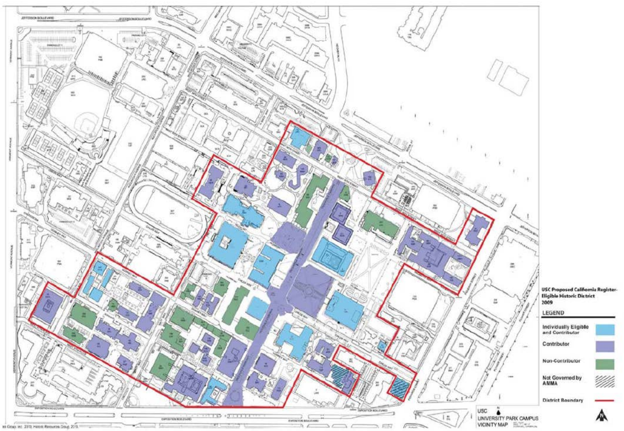
FIGURE 7. MAP OF POTENTIAL HISTORIC DISTRICT (AMMA FIGURE 2)