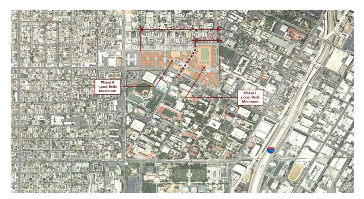
FIGURE 2: DEVELOPMENT PHASING IN SUBAREA 3

Note: Actual development may include an Academic Tower on the Northeast Corner of Jefferson Boulevard and McClintock Avenue and a Residential Tower located mid-block along McClintock Avenue. Each Tower shall comply with floor area limitations established in Table 1 (Land Use Table), and with height, setback and stepback limitations established in Section 7 (Urban Design Regulations).